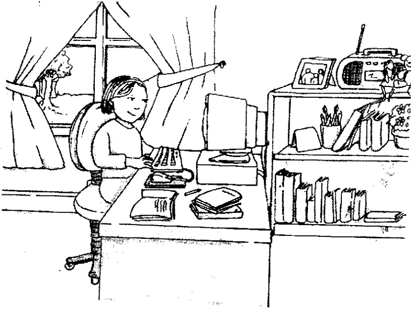
Illustration Girls should receive a good education